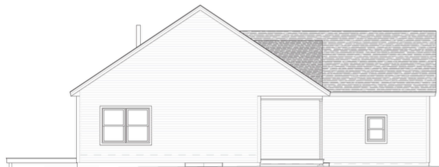
The Alder - Left Elevation