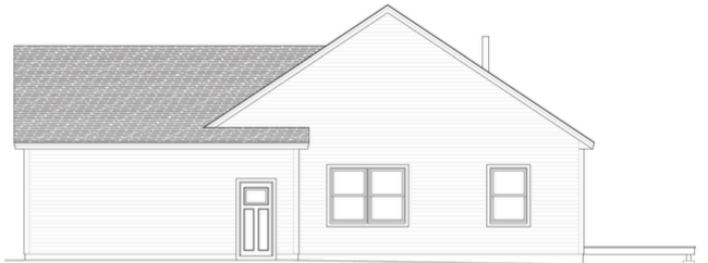
The Alder - Right Elevation