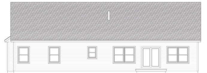
The Alder - Rear Elevation